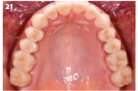
Figure 21: The situation post-adhesive cementation of pressable ceramic monolithic posterior tooth crowns.

Next, the monolithic restorations were checked on the model (Fig. 19 and 20) and cemented in the mouth in the practice using adhesive (G-CEM LinkForce, GC) (Fig. 21).