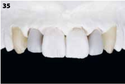
Figure 35: Finishing of the crowns with incisal and effect materials (GC Initial LiSi)