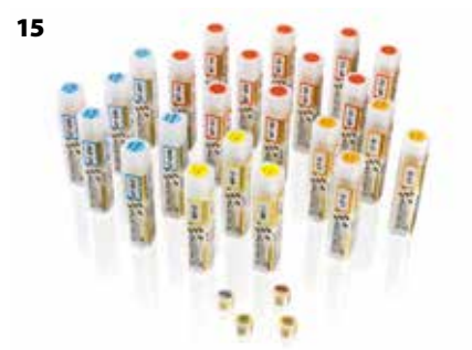
Figure 15: The different colours and translucencies of the lithium disilicate GC Initial LiSi Press.