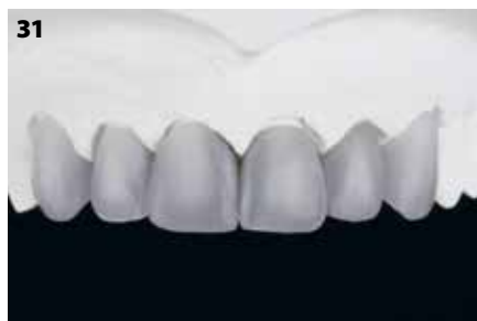
Figure 31: The milled wax caps were...

good colour depth and vibrant translucency, we first applied GC Lustre Pastes (ceramic stains) (Fig. 34).