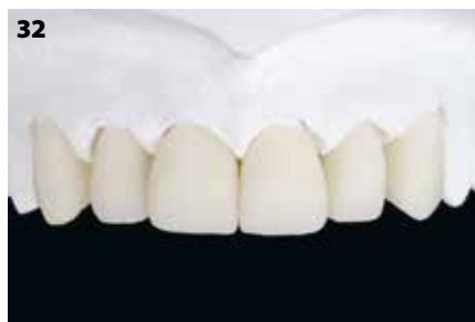
Figure 32: ...transferred into LiSi Press using press technology.