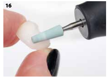
Figure 16: Finishing the surfaces with small ceramically-bound stones