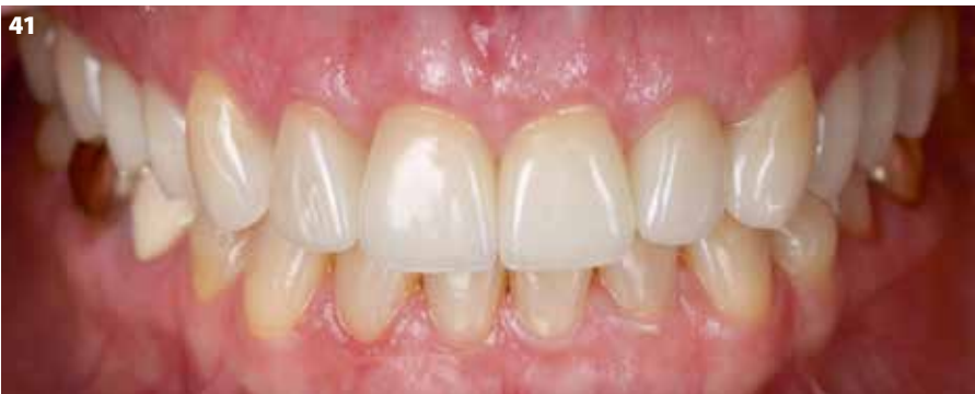
Figure 41: Situation immediately after adhesive cementation of the crowns