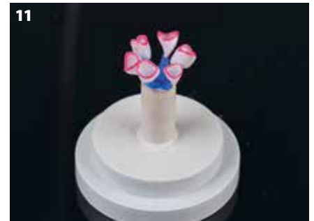
Figure 11: The wax models sprued on the ring base with the front tooth crowns as an example