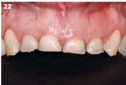
Fig. 22 Challenge: rehabilitation in the upper front tooth area

Rehabilitation in the front tooth area had a high degree of difficulty (Fig. 22). The first requirement for a smooth red-white procedure was a surgical crown extension. The dentist used a deep-drawing template of the set-up as orientation for the aesthetic sequence of the crown edges (Fig. 23 to 27). During the healing phase, CAD CAM- manufactured long-lasting temporary solutions helped to shape the gingiva (Fig. 28).