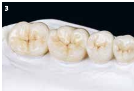
Figure 3: With around 450 MPa, this provides a high degree of safety for monolithic restorations in the posterior region.

acid after removal from the mould. This is another convincing argument for the new pressable ceramic. We would ideally like to remove an application as sensitive and critical as acidification from our laboratory. This makes the procedure and the working processes within the laboratory considerably safer. The extremely thin reaction layer after pressing is based on the investment LiSi Press Vest, a new development from the company GC. The manufacturer is highly skilled in the area of investment materials and in this case, they concentrated on the time-consuming reaction layer after pressing. The problem was solved with a special formula. There is barely any reaction layer present, making the process of removal from the mould considerably simpler. The pressed