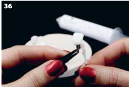
Figure 36: Firing on suitable honeycomb firing trays, matching retaining bolts and fluid firing pads

As a next step, the crowns were completed with incisal and effect materials (GC Initial LiSi) and fired (Fig. 35 and 36). (ÚCave: The LiSi restorations should not be heated or cooled too quickly. Quick temperature changes can cause the material to tear. During firing, a suitable firing tray - e.g. a honeycomb tray - as well as retaining bolts and fluid firing pads should be used.)