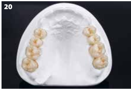
Figures 19 and 20: Checking the monolithic posterior crowns on the model