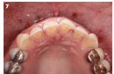
Figure 7: Insufficient restorations in the upper posterior region and tooth structure damage in the front tooth area

to defective functions, to provide a restoration based on gnathological criteria. Because it can be worked perfectly in the posterior area using manual modelling, we opted for press technology. The eight individual crowns were to be constructed first in the CAD software, then milled in wax, finely reworked manually (edge regions, occlusion) and then pressed in ceramic. In the front tooth area, partially anatomically reduced crown frameworks were to be produced and veneered.