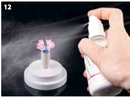
Figure 12: Spraying the wax surfaces with the SR liquid to refine the surfaces using the example of the front tooth crowns