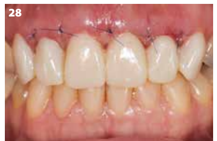
Figure 28: Post-operative situation with long-lasting temporary solution after eight weeks