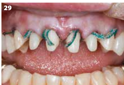
Figure 29: Eight months later: Preparation for impression-making

The master model was digitalised and the STL data were imported into the construction software (3Shape). The set-up (Fig. 30) could be milled in wax in accordance with the planning documents (Fig. 31) and could then be transferred into GC Initial LiSi Press. After the quick process of removal from the mould, the LiSi Press crowns fitted very well on the master model (Fig. 32).