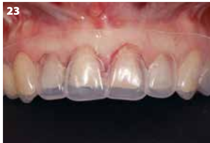
Figure 23: A rail template visualised the ideal crown sequence in the cervical area.