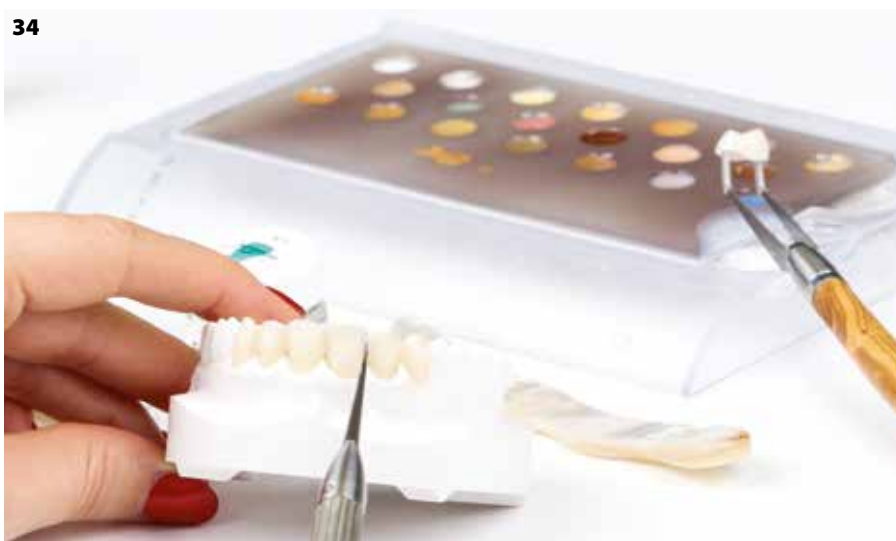
Figure 34: Application of GC Lustre Pastes (ceramic stains) to the reduced portions to customise the structure