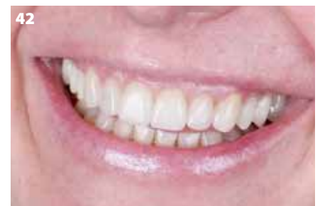
Figure 42: Harmonious view of the lips. Shape and colour adapt extremely well.