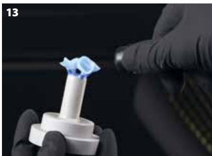
Figure 13: Thorough dispersal of the liquid with pressurised air using the example of the posterior tooth crowns