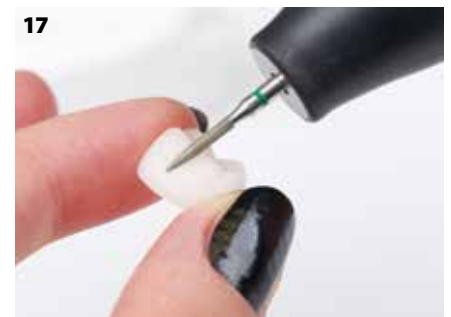
Figure 17: Finishing with diamantes. It should be ensured that it has cooled sufficiently.