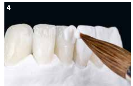
Figure 4: Higher resistance also provides a safe basis for a partially reduced veneer (Initial LiSi).

GC Initial Lustre Pastes NF are used to refine monolithic restorations (Fig. 3). The three-dimensional ceramic stains encourage high colour depth and ensure vibrant translucency. Where aesthetics are concerned, we like to work partially monolithically and veneer the visible portions with GC Initial LiSi (Fig. 4). This veneering ceramic