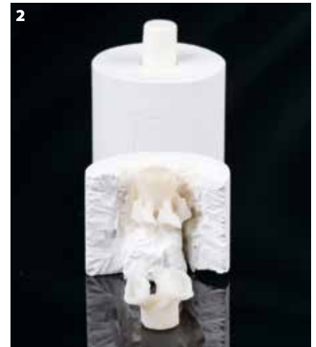
Figure 2: LiSi Press after pressing: the non-existent or very thin reaction layer simplifies removal from the mould and blasting.

object is just blasted with glass beads. After this, the technician focuses directly on refining the restoration. In our experience, 15 to 20 minutes can be saved for each unit.