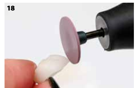
Figure 18: Pre-polish with coordinated special rubber polishers

The objects were finished with small ceramically-bound stones and