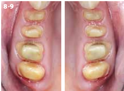
Figure 8 and 9: The prepared posterior teeth prior to impression