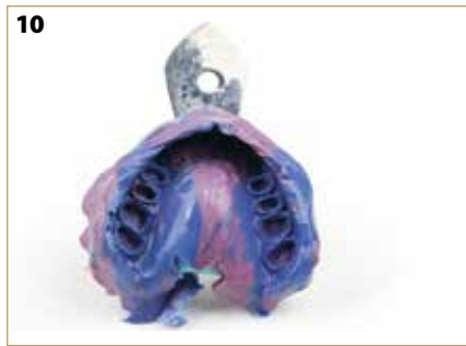
Figure 10: The situation was clearly moulded using polyether impression-making material