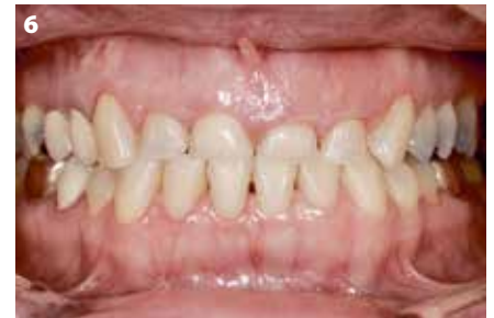
Figure 6: The initial situation poses a major challenge for us as the team responsible for treatment

The patient consulted the practice with a challenging situation in her upper jaw (Fig. 6 and 7). She had insufficient metal ceramic restorations in the posterior region. The front tooth area had a marked lack of hard tooth tissue. After an initial diagnosis and consultation, pressable ceramic rehabilitation was chosen. For us, portrait photography is an important component of diagnosis, as it can be used to collect important information for planning the therapy. In this case, it was important to consider the origins of the tooth damage, which could be traced back