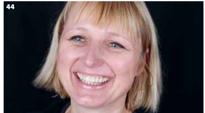
Figures 43 and 44 Before/after juxtaposition. The patient was treated with individual pressable ceramic crowns in the upper front tooth and posterior region, after a functional pre-treatment and a surgical crown extension.