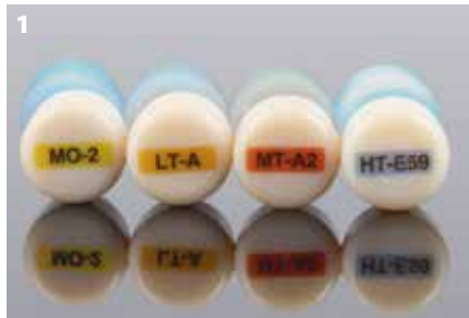
Figure 1: Overview of the four different translucency levels of GC Initial LiSi Press with fluorescing properties

We distinguish between the pressing of manually modelled objects and the pressing of milled wax structures. The actual pressing process is similar to the usual process in essence. What makes LiSi Press's manufacturing process unique is the thin reaction layer (Fig. 2). There is no need for "etching" acidification in hydrofluoric