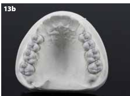
Figure 13a-13b: The milling of wax in the CAD / CAM workflow is for us essential (hybrid technology)

and the pressing process was started once the pellet (Fig. 15) had been selected. (→ Cave: We recommend the single-use pressing stamp. Quick cooling after the pressing process should be avoided.)