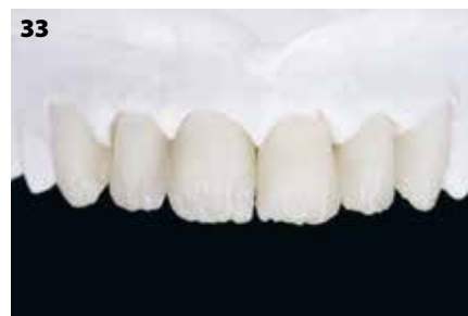
Figure 33: Cutback in the enamel area as preparation for thin film veneering. GC Lustre Pastes are then applied