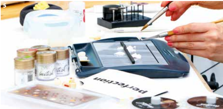
Figure 5: Optimal interface to GC Initial LiSi. This veneering ceramic has been manufactured exclusively for lithium disilicate structures.

includes a colour and layer system (Fig. 5) which distinguishes itself through an agreed heat extension coefficient, a low firing temperature and high stability. It is not complicated to use and can be used in both individual layering, which many technicians like, and in the cutback technique. We prefer partial monolithic veneering and have had very good and stable results with it for many years now. We always design critical areas (palatal, occlusal) fully anatomically. This means that aesthetic aspects and safety are perfectly combined.