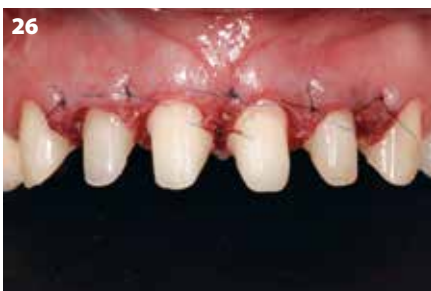
Figures 26 and 27: Immediately after the surgical crown extension (left) and the situation after a few weeks (right)