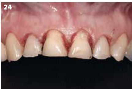
Figures 24 and 25: Surgical crown extension and pre-preparation of the teeth for fitting of the long-lasting temporary solution