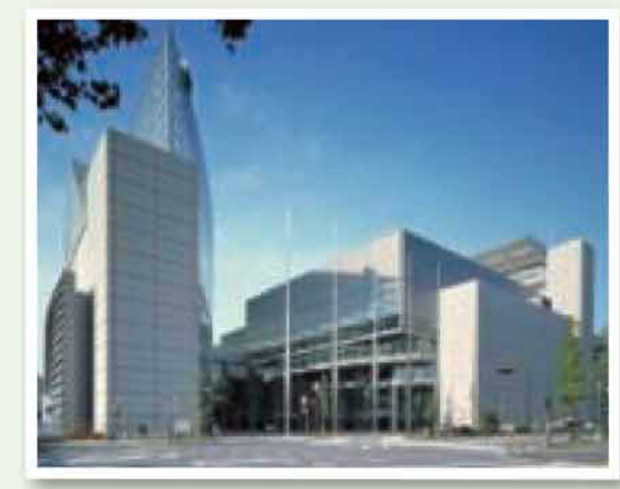
TOKYO INTERNATIONAL FORUM